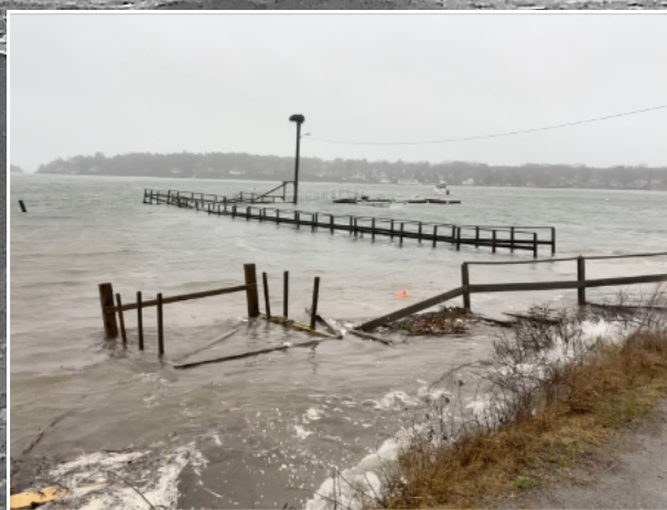
TIDAL DATUM, TIDE HEIGHT AND DOCK TO SCALE